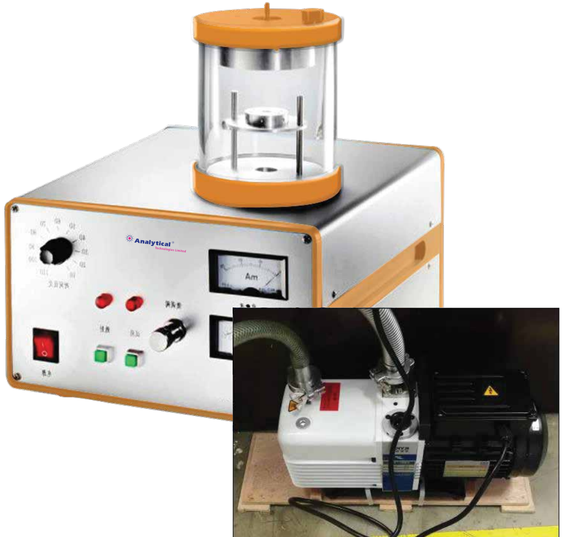
The Pump Used To Make Low Vacuum For Ion Sputtering Coater

To optimize the conductivity of non-conductive samples and improve their ability to observe under scanning electron microscope